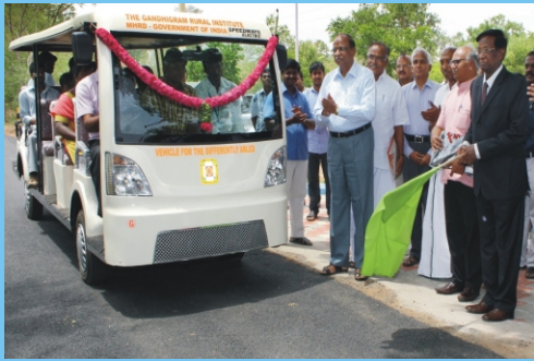
Battery Vehicle for the Special Needs Students