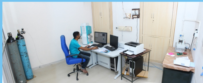
Nano Science Technology Lab