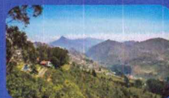
Kodaikanal - 88km

Abstracts and Full Papers can be submitted through