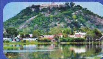
Palani - 70 km