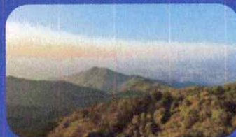
Sirumalai - 38 km