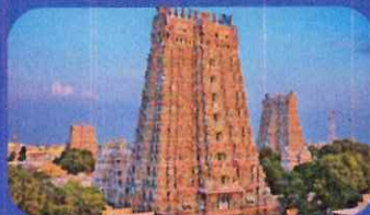
Madurai - 53 km