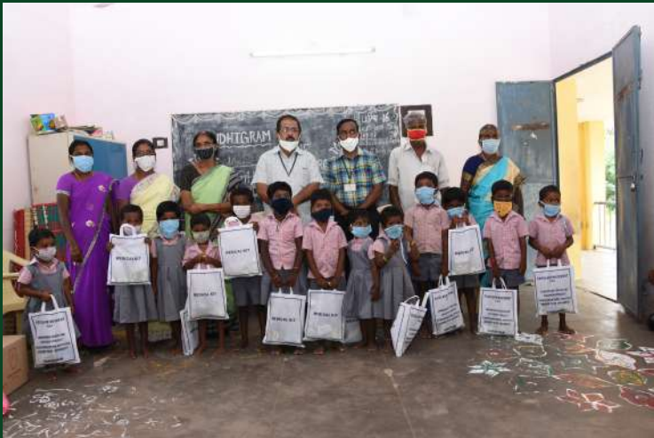
Medical kit distributed in Melkaraipudhur