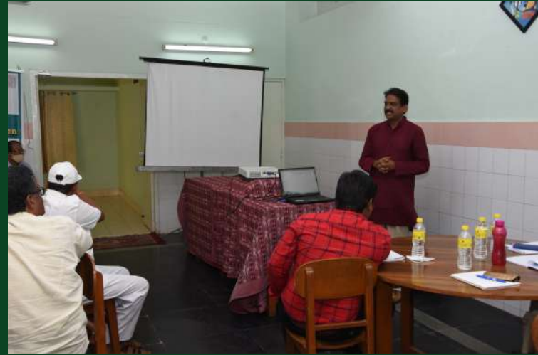
Preparation of Training Manual for Children