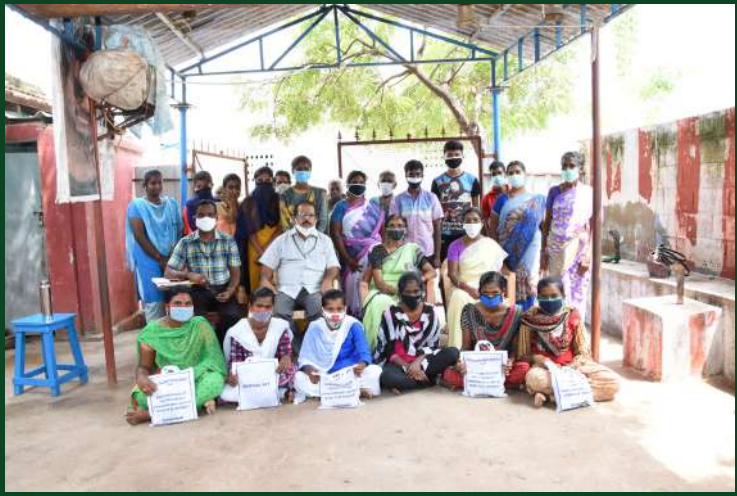
Medical kit distributed in Agaram