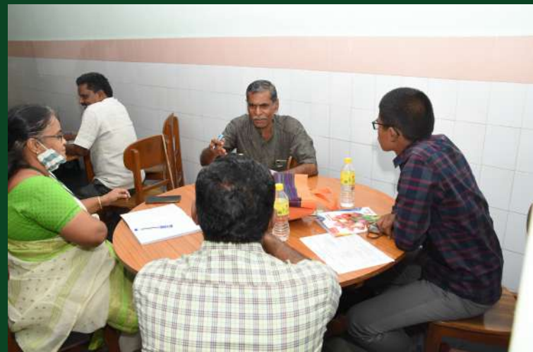
Activities in Preparation of Training Manual for Children