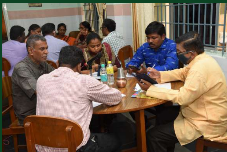
Activities in Preparation of Training Manual for Children

the children start asking a lot of questions, he said. In the fourth stage, i.e. from 6 to 12 years of age, children are in a state of impulsiveness and depression. Then, they will develop cultural skills. They will be more involved in team activities. Boys learn to ride a bicycle. He said children should do age-appropriate activities but engaging in activities such as motorcycling at this age is a misguided parenting practice and it is an act of teaching in violation of the law.