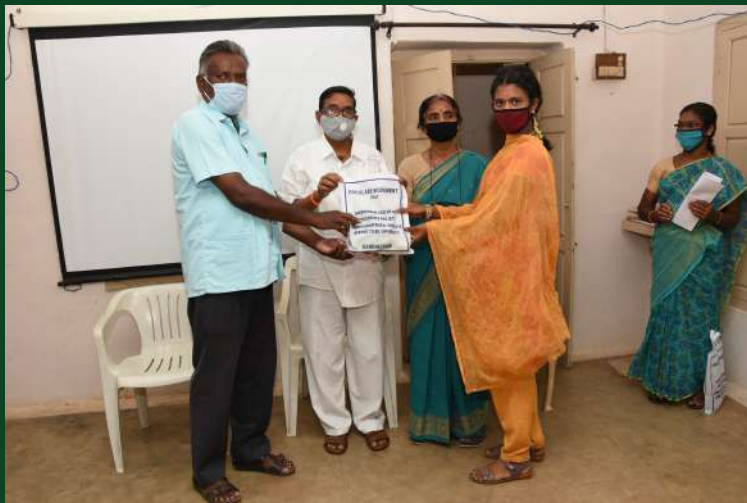
Medical kit distributed in GRI