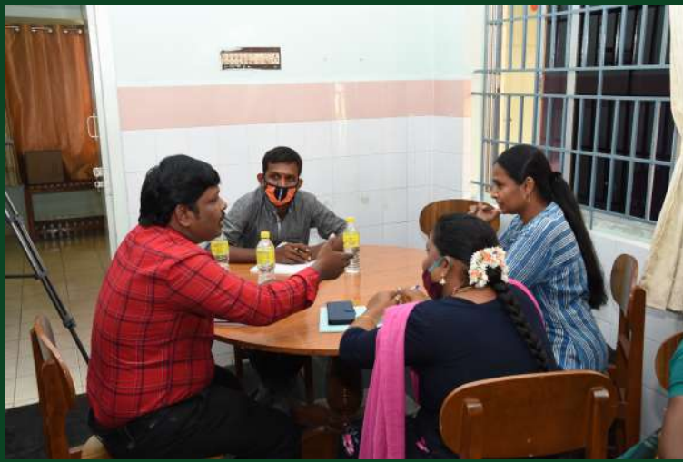
Activities in Preparation of Training Manual for Children