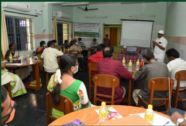
Preparation of Training Manual for Children