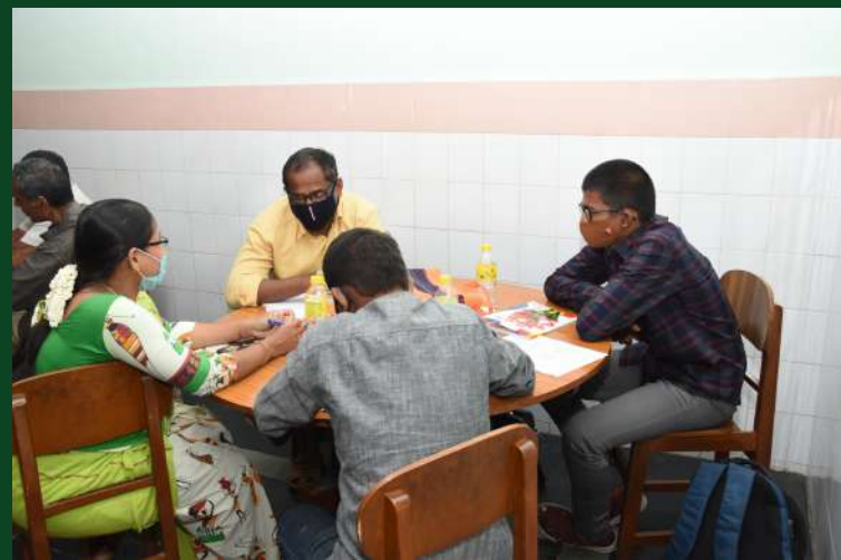
Group Discussion in Preparation of Training Manual for Children