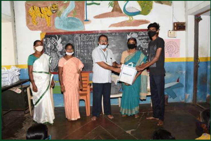
Medical kit distributed in Chettiyapatti

“ Necessity is the mother of invention ”