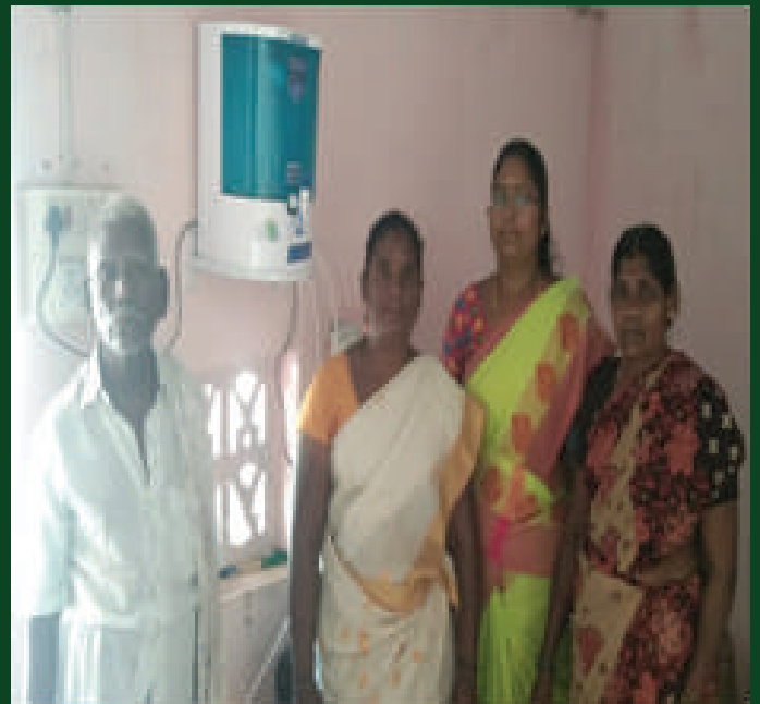
Water Filter Distribution to GRI Creche Centre

“ Every man is the architect of his destiny ”