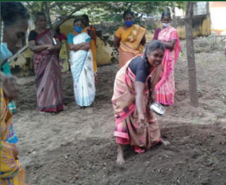
Mushroom Training Programme