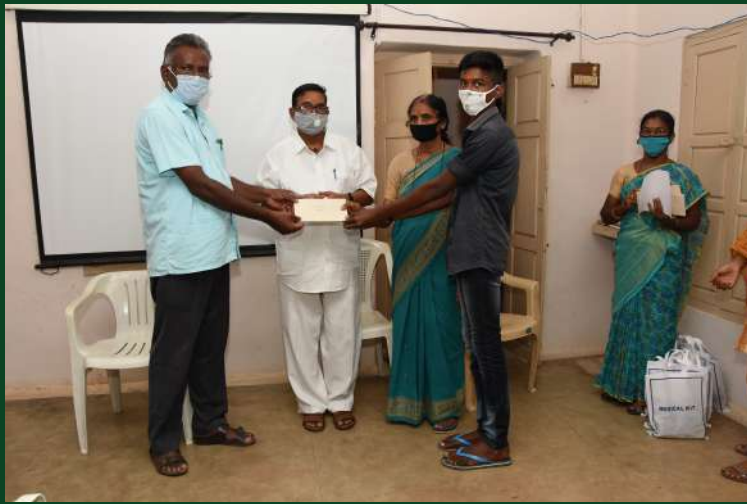
Financial Assistance to the Poor Families