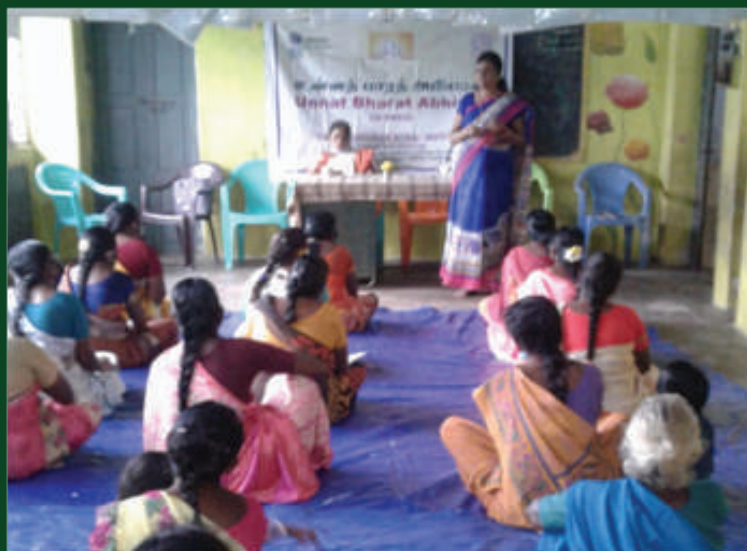
Training Programme on Vegetable Graden

“ You play with fire, you’ll get burned ”