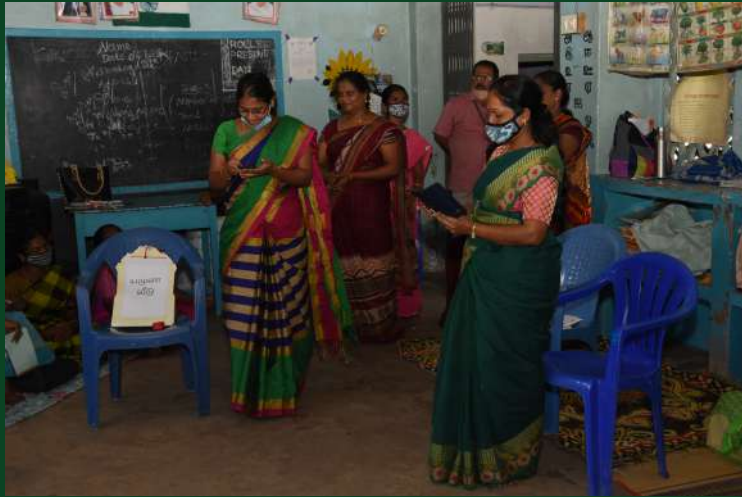
Roleplay in International Women's Day 2021