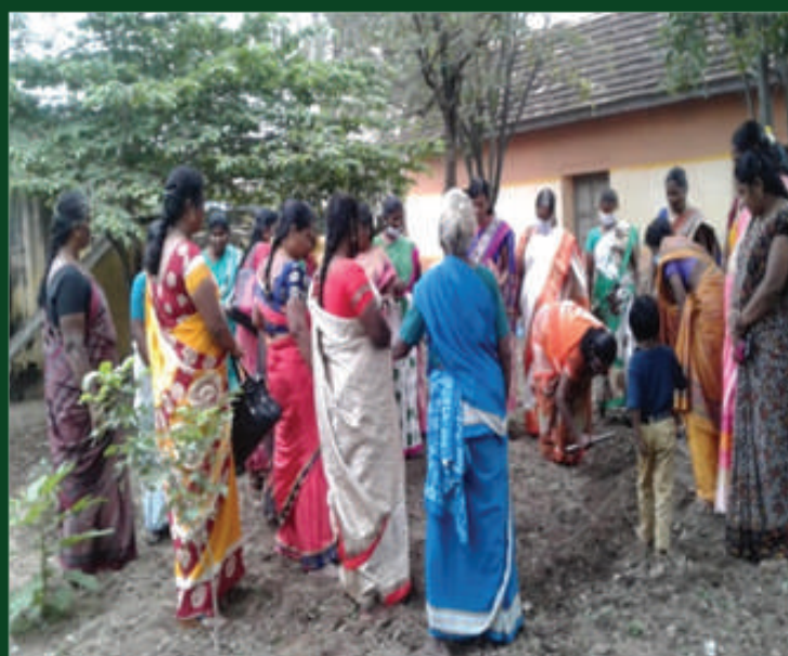
Training Programme on Preparation of Vegetable Garden