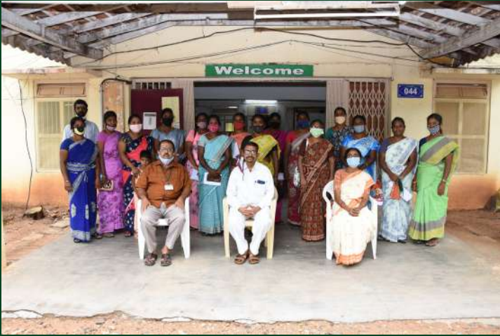
Team of Balwadi Teachers