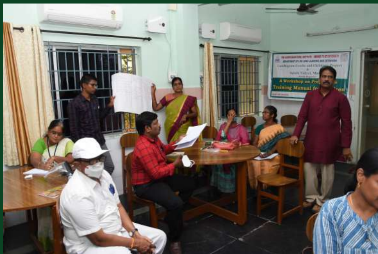
Activities in Preparation of Training Manual for Children