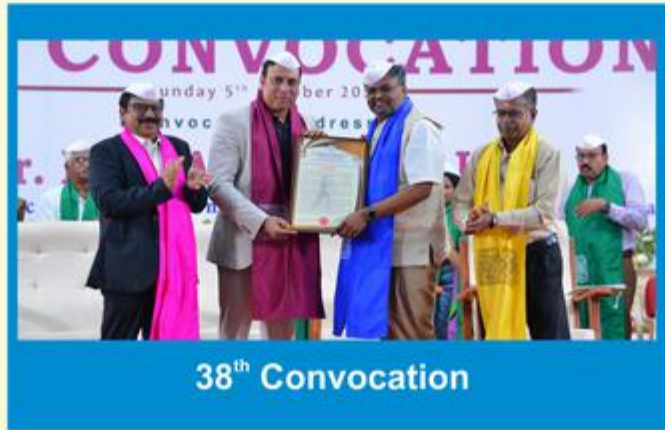
38 th Convocation