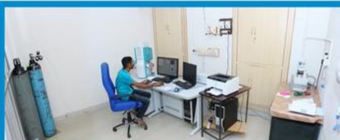
Nano Science Technology Lab